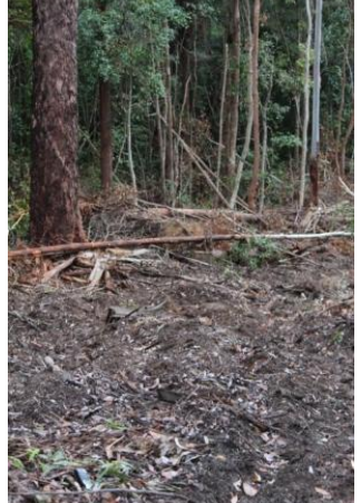
Camphor Laurel a) now under rainforest canopy at base of 1 km almost clear fell 40 m of threatened species habitat b) germinating at top of c) 25 degree slope, bare earth 120 metres for 3 trees (GPS foreground bottom left )

Silt (and herbicide) pour down mountainsides in the rain as recovered ecosystems deemed plantations are clear felled in areas some of which were last logged 60-70 years ago.