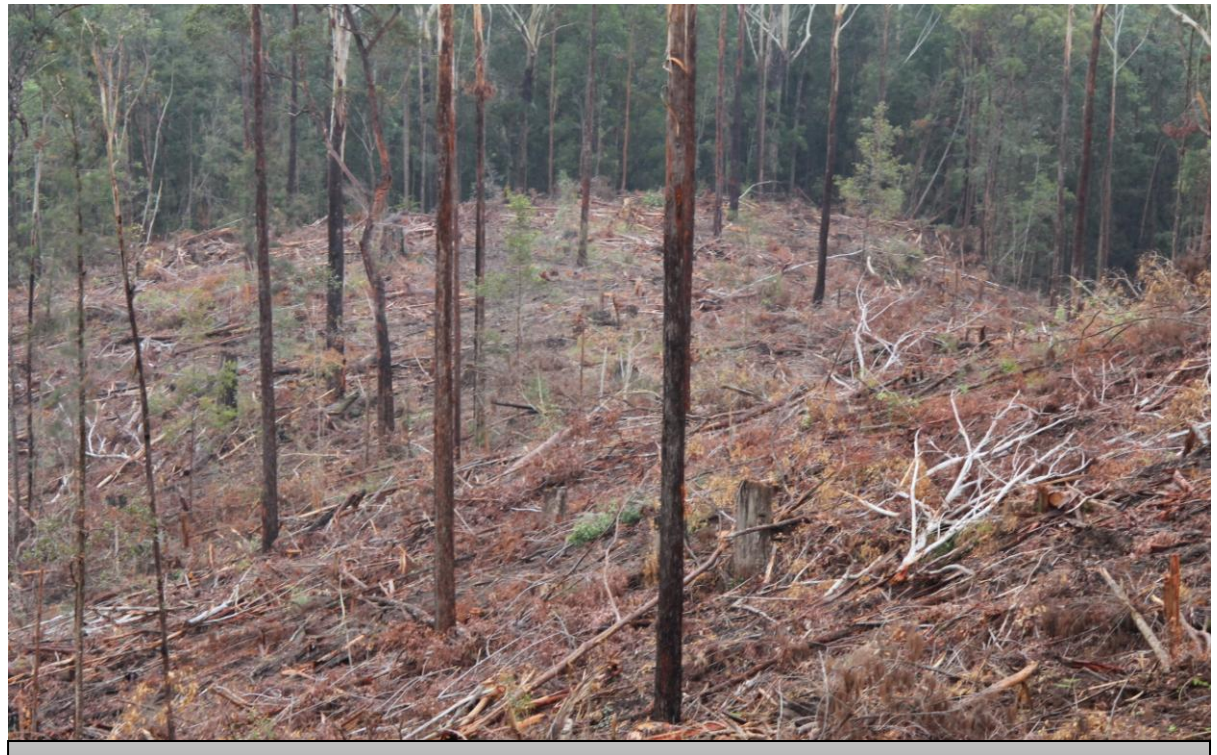
The NEW Native Forest cleared of understorey, can be cut at 20 cm diameter

This clearing paves the way for feral animals to move swiftly through devastated coastal forests cleaning up what native creatures escape the slaughter, for their trees and hollows are gone.