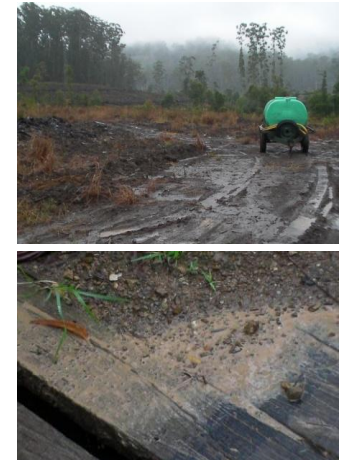
Silt - straight into Pipeclay Creek via bride to block gills or smother native aquatic life