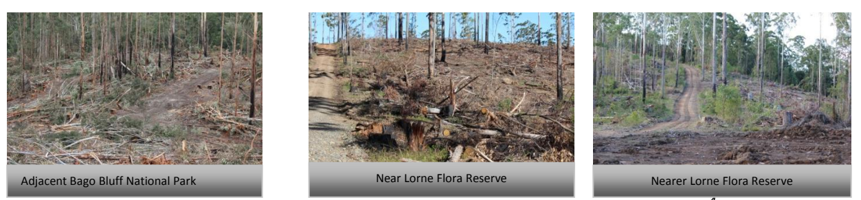
Alter native forest light regimes to create one species dominance<sup>4</sup>