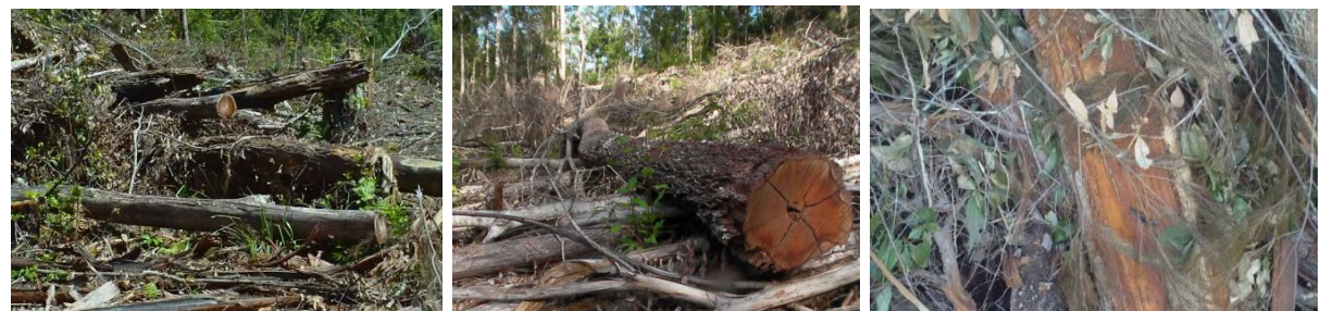
Fell and suppress from natural regrowth cycles species not considered merchantable, i.e. most ground, understorey and canopy species whether or not food or habitat for threatened wildlife<sup>3</sup> Centre, right Glossy Black Cockatoo feed trees routinely felled or smashed. Tallow wood koala food is frequently destroyed.

Trees are being cut as fast as possible in NSW native coastal and hinterland forests (whether or not they are even sold) and logging operational objectives include: