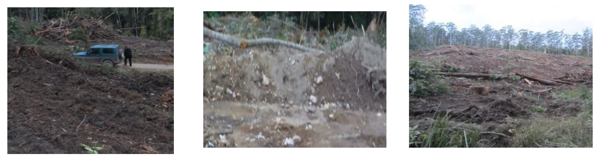
Maximise soil disturbance during logging to favour regeneration of Blackbutt